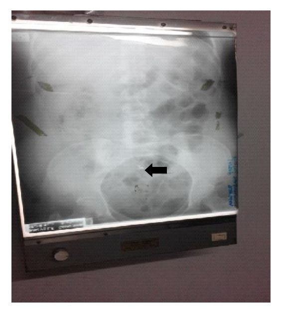
Fig 2: Plain abdominal x-ray with arrow pointing to the copper T device

There was no accompanying abdominal pain, change in her bowel habit (constipation, diarrhoea), hematochezia, anal pain or swelling. During the pelvic examination, about 4cm length of the IUCD strings was visible at the anal orifice. Pelvic ultrasonography showed a morphologically normal sized uterus with the IUCD located outside the uterus, possibly in the rectum. An abdominal X-ray confirmed the presence of the IUCD in the pelvis posterior to the uterus (Fig.2). The patient was counseled on the need to undergo an examination under anaesthesia with removal of IUCD. She had rectal washouts and an informed consent was